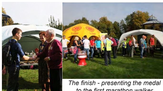
The finish - presenting the medal to the first marathon walker